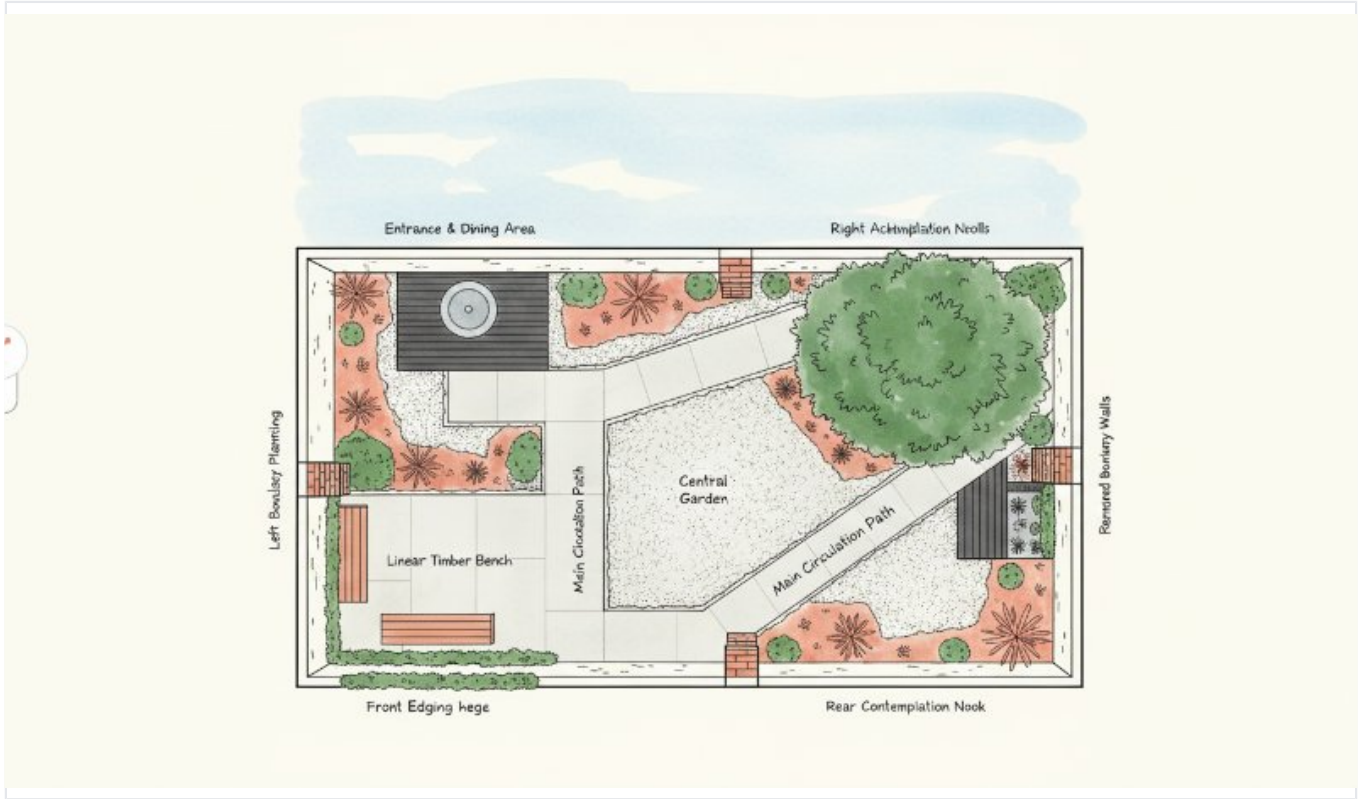
Garden Layout Plan — print this and take it outside.

The spatial composition employs a strong axial alignment, with the main path creating a clear visual corridor from front to rear. Rectilinear paving defines the social zones, contrasted by the organic flow of the central gravel garden and planting beds. Proportional balance is achieved by varying the depth of planting beds and the scale of hardscaping elements, ensuring the narrow garden feels expansive rather than confined. The existing evergreen tree is integrated as a key vertical element, anchoring the mid-ground.